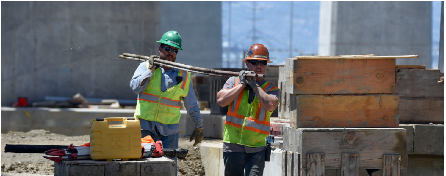
California contractors are feeling good about 2018, but they're having a hard time finding enough skilled workers.