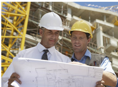
Commercial Project Manager